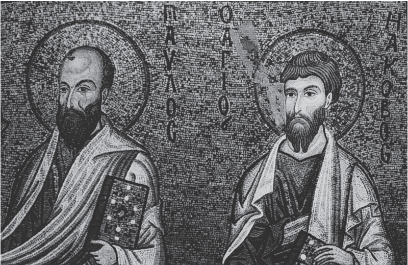
Paul (left) and James the Just (right) hold the Scriptures in this early mosaic ( Mar-torana, Palermo ).

(A list of the Roman emperors, correlated with listings of the bishops of Rome, Jerusalem, Alexandria, and Antioch, is given in Appendix 2.)