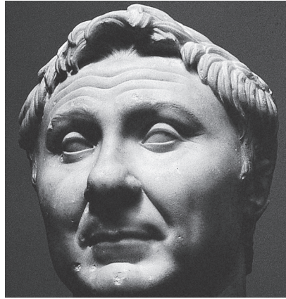
Head of Gnaeus Pompey, who conquered Jerusalem in 63 B.C. ( Glyptotek, Copenhagen ).

These facts also demonstrate that another prophecy was fulfilled in the appearance of our Savior Jesus Christ. The text in Daniel specifies the exact number of weeks until the rule of Christ—I have treated the subject elsewhere 9 —and prophecies that after these weeks the anointing of Jews will cease. Clearly this was fulfilled at the time our Savior Jesus Christ was born. These preliminaries were necessary to underscore the truth of the date.