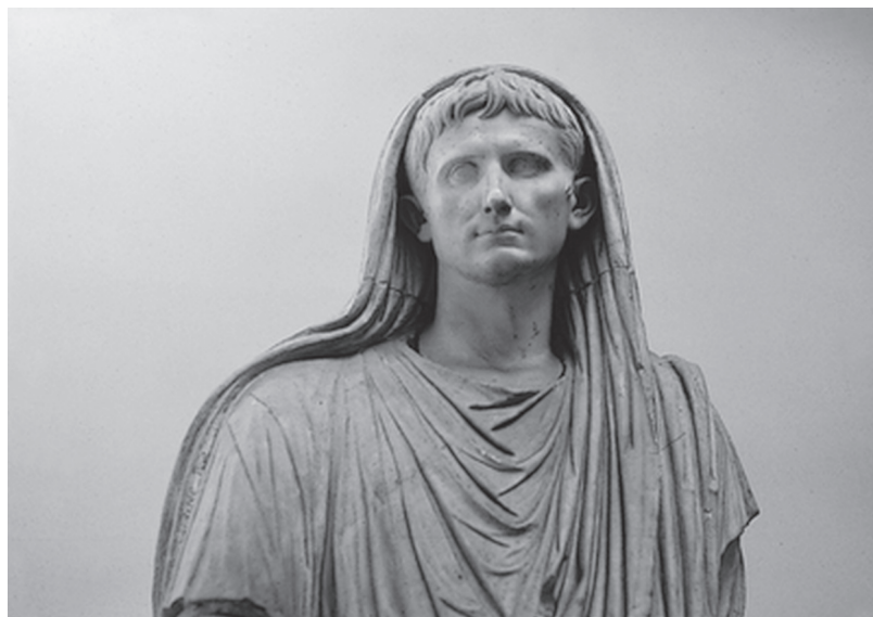
Statue of Augustus, emperor 27 B.C. to A.D. 14, in the garb of a priest ( Museo Nazionale, Rome ).

would lead to nothing but total slavery, and they called on the people to defend their freedom. 7